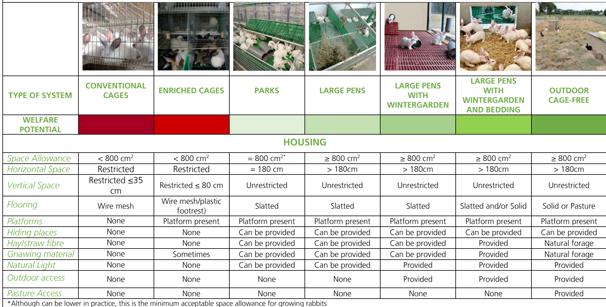
Table 4. Welfare potential of rabbit production systems